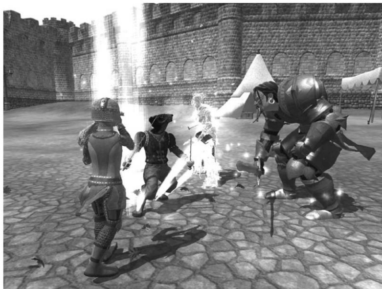
FIGURE 1 Guild members band together to accomplish large tasks that cannot be completed alone, such as defeating a tough enemy.

Performance metrics for groups and individuals in EQII involve the success rates for combat, gaining experience, exploring areas, creating items, and gathering resources. As players rise in ability and power, they are prompted to enter new and unexplored areas. New abilities allow players to deal with and fend off ever more exotic and dangerous creatures and to acquire their accompanying treasures. There are also various metrics attached to craftwork, including gaining currency by selling or gaining items through barter. These various “mechanics,” or game incentive schemes (Sellers, 2006), prompt players to act together and give rise to a large number of social and communication phenomena worth studying.